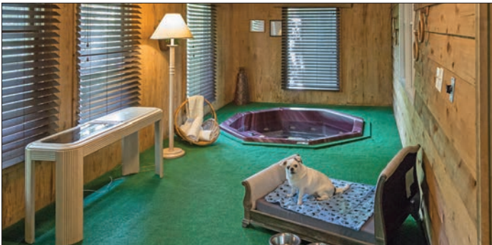
1 & 2 Bedroom Cabins with Hot Tub & Fireplace (Pet Friendly!) 2 Bedroom shown here.