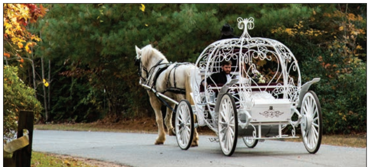
View Packages for 20 - 175 guests online.