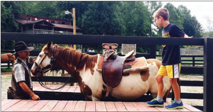
Ride a horse with North GA Horse & Carriage Inc on site!

Cabins – Hotel Rooms – Bi-Level Suites Outdoor Pool – Hot Tubs – Fire Pits – Horse & Carriage Rides – Gem Mining – Nature Trails Horseshoes – Volleyball Courts – Restaurant